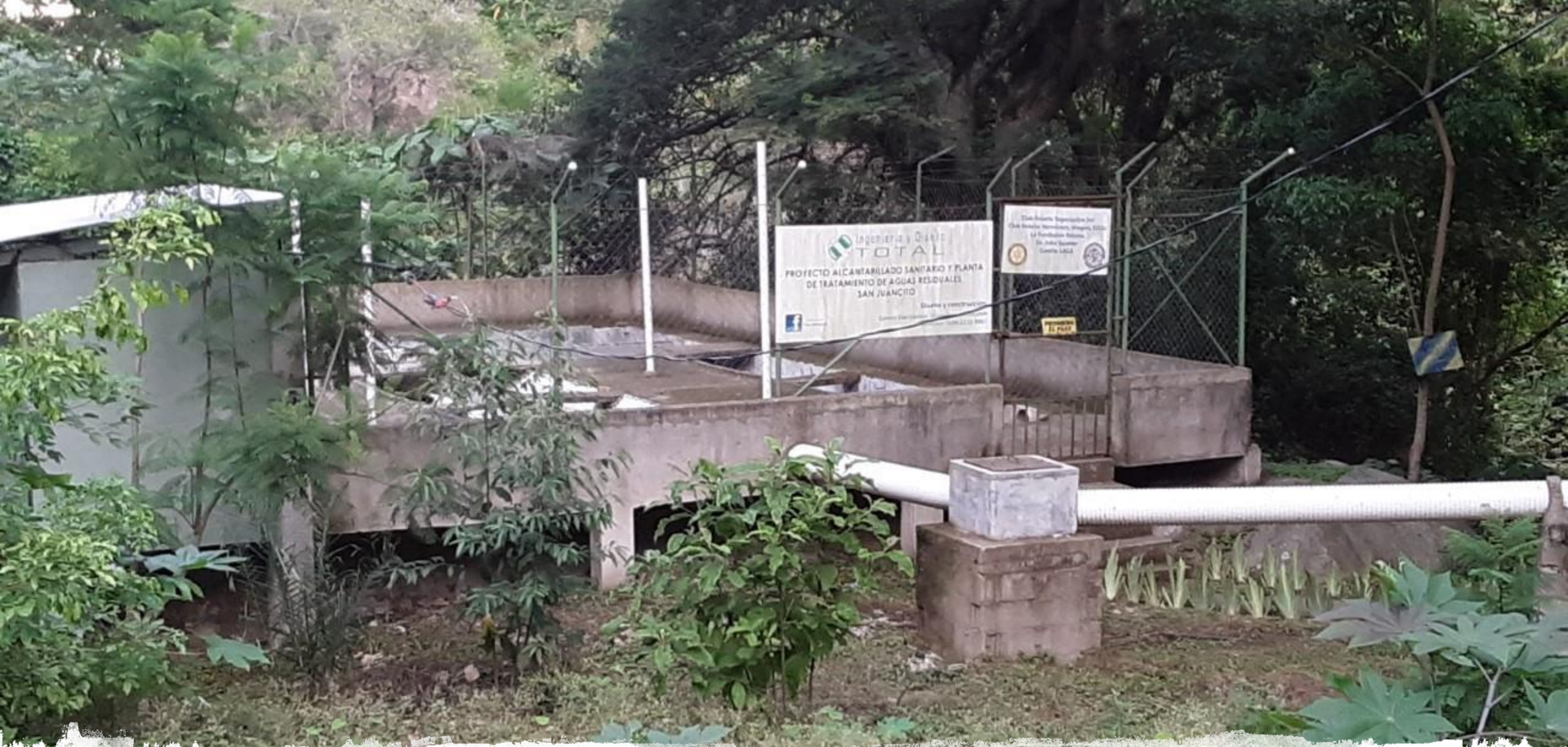
~Sewer plant constructed in San Juancito, sponsored by the Rotary Club and various individuals ~