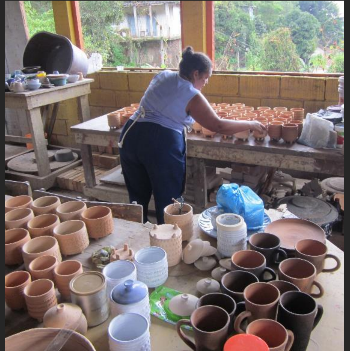
Ceramics Shop in San Juancito